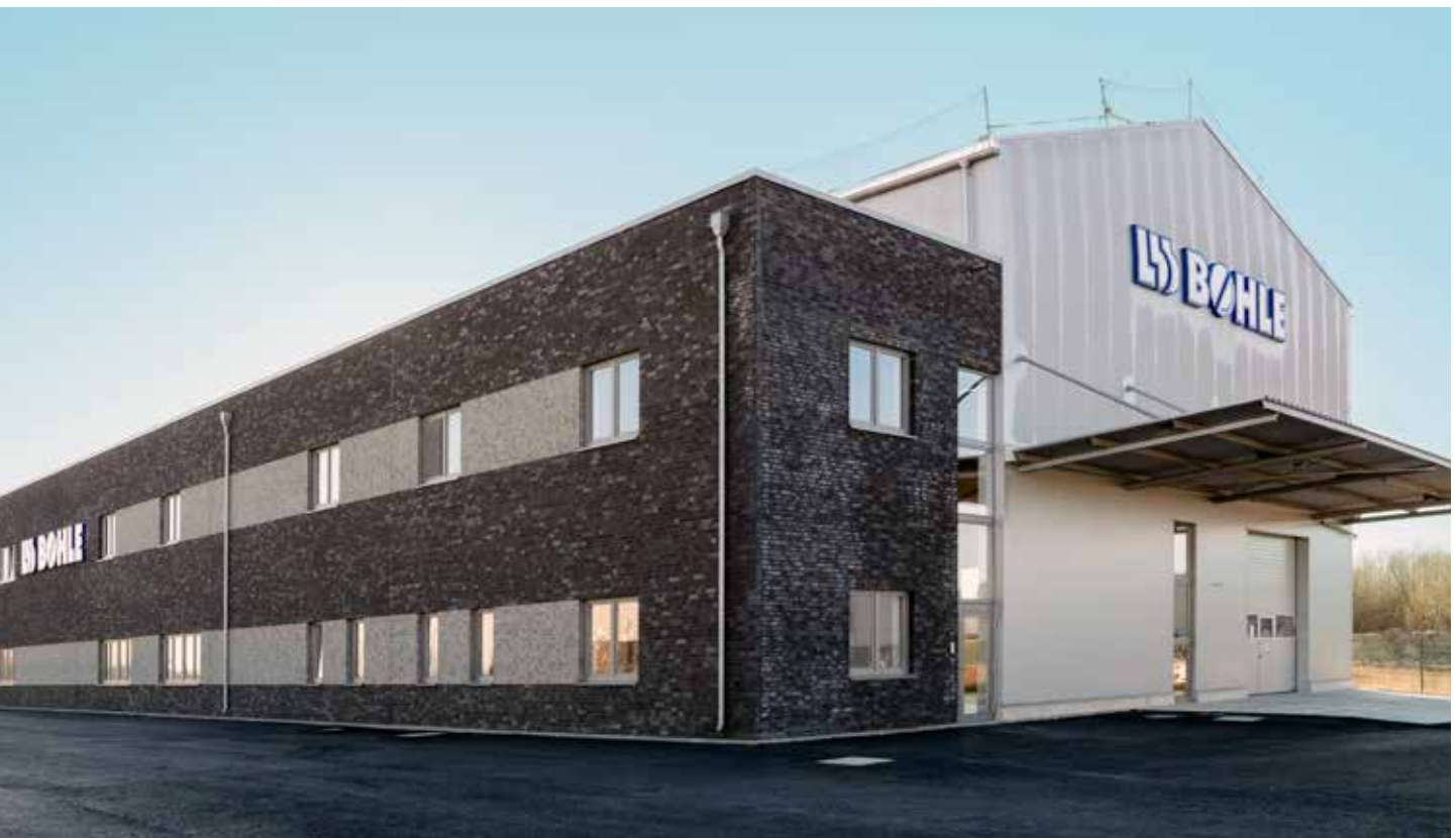
Plant 4 was built in the immediate vicinity of Plant 3 in Ennigerloh. Production of the machines has already successfully started.