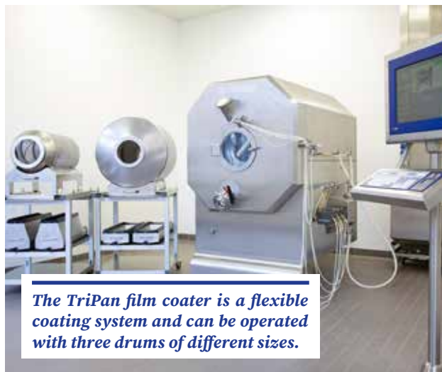
The TriPan film coater is a flexible coating system and can be operated with three drums of different sizes.

At the Service Center in Ennigerloh, pharmacists, engineers, process, and software specialists work hand in hand at L.B. Bohle. Since 2005, tests can be carried out on the entire manufacturing process of pharmaceutical tablet production on a pilot scale. The installed machine components are continuously updated or replaced to match the current product range in each case. Trials for batch sizes from 10 to 30 kilograms are possible on more than 600 m 2 .