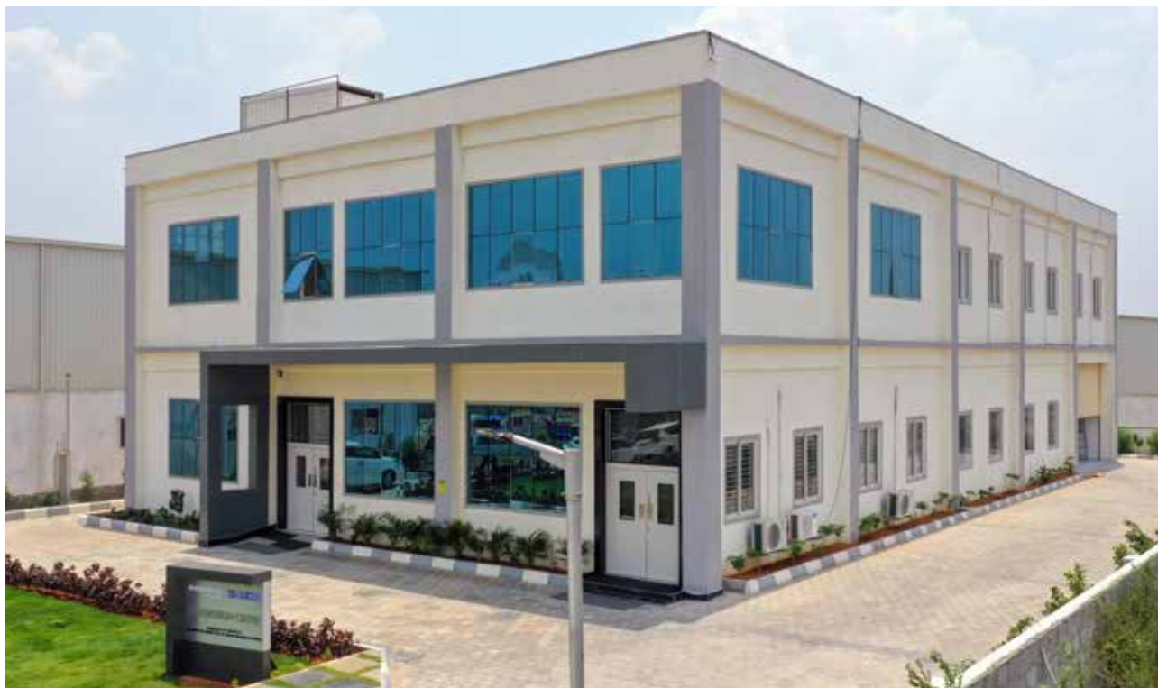
At the Innovation Center in Hyderabad, L.B. Bohle and KORSCH AG offer optimal conditions for product testing and process optimization.