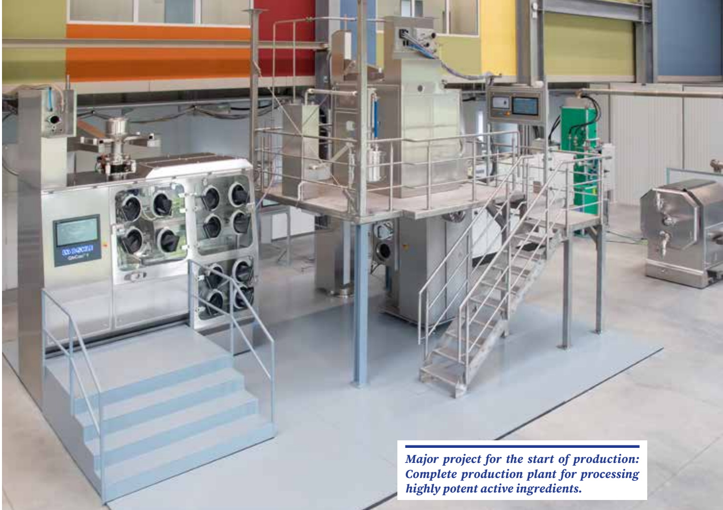
Major project for the start of production: Complete production plant for processing highly potent active ingredients.