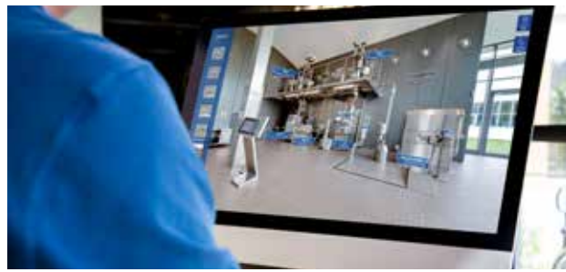
Development centers can be experienced: For the Technology Center and the Service Center, L.B. Bohle now offers a 360° panorama tour.