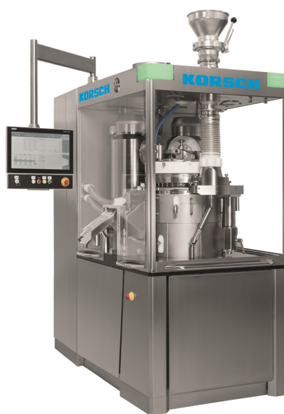
KORSCH XL 400 4

Others suggest to have a larger head-flat to increase the dwell time. Increasing cohesion can also be achieved by increasing the blend moisture content, water being a great plasticizer.