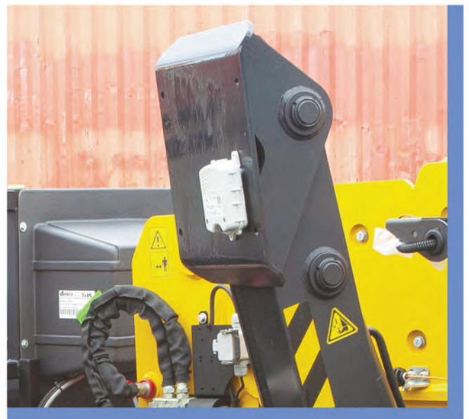
Different usage purposes