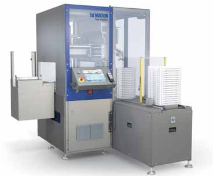
Mikron Tray Handler