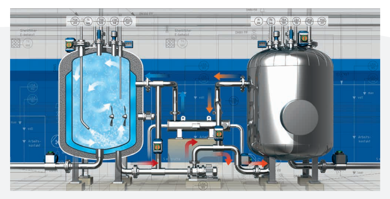
SteriFix C batch biotechnology for safe wastewater sterilisation of volumes ranging from 100 l per batch up to 20 m<sup>3</sup> per day