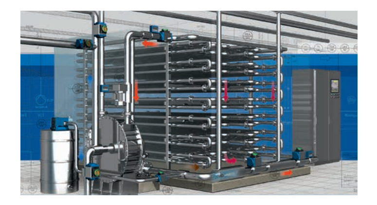
SteriFix E continuous wastewater sterilisation for treating volumes of continuously inflowing wastewater from 100 l/h to 15 m ^3 /h

SteriFix plants are designed to safely inactivate, sterilise and disinfect wastewater containing infectious or genetically altered materials via thermal sterilisation. Simultaneously, microorganisms and bacteria are eliminated by this process, while viruses, plasmids and DNA fragments can also be deactivated. The SteriFix sterilisation process additionally delivers the optimal sterilisation output for the most efficient energy input.