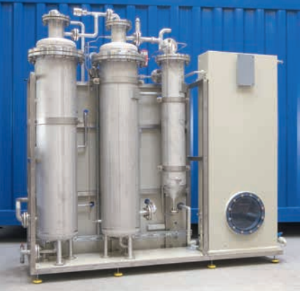
Ozonation plant built as a modular unit

Modular plant system for the detoxification of wastewater at a pharmaceutical production site